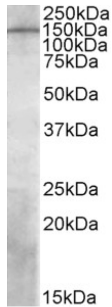
EB09549 (1 \mu g/ml) staining of Human Temporal Cortex lysate (35 \mu g protein in RIPA buffer). Primary incubation was 1 hour. Detected by chemiluminescence.