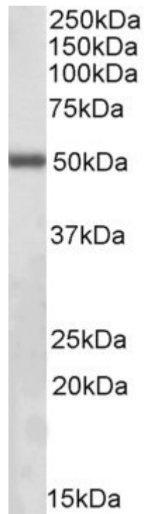
EB05120 (0.5 \mu g/ml) staining of NIH3T3 lysate (35 \mu g protein in RIPA buffer). Primary incubation was 1 hour. Detected by chemiluminescence.