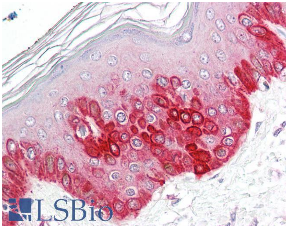
EB07893 (3.75 \mu g/ml) staining of paraffin embedded Human Skin. Steamed antigen retrieval with citrate buffer pH 6, AP-staining.